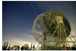
The night sky in May