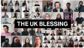
Churches coming together to sing