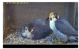
Peregrines about to hatch

Westgate Helpers - 07731 198693 – westgatehelp2020@gmail.com