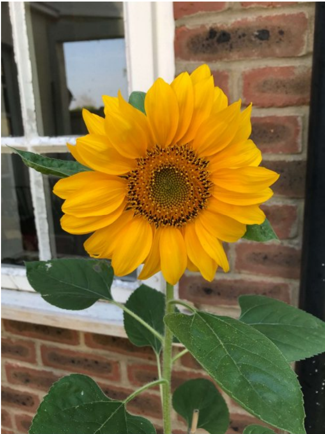
The King family – 162cm tall – garden grown