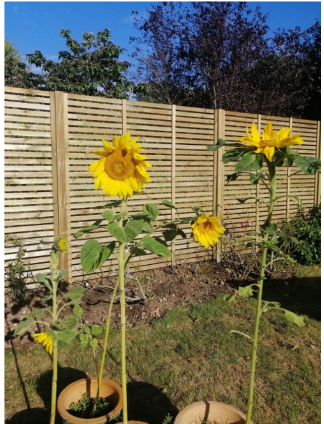
The Sollys - Tallest 124 cm tall – pot grown