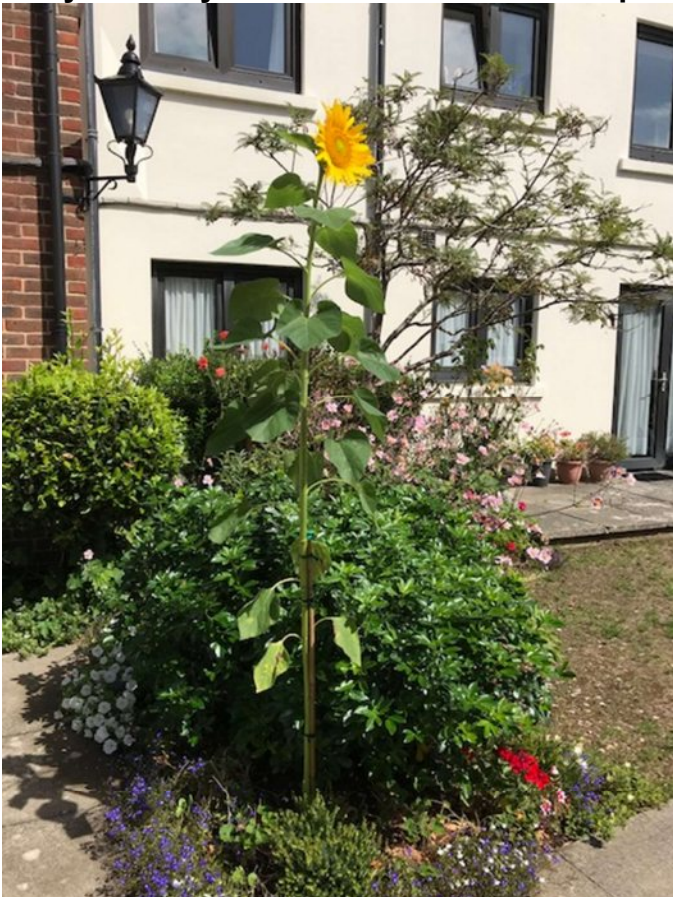
Derek Foote – 6'6" - 198cm – garden grown

Thank you to everyone who entered our sunflower growing competition.