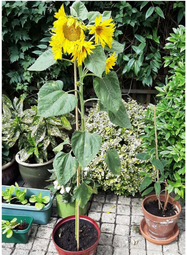
Desmond Evans – 134cm with 8 blooms